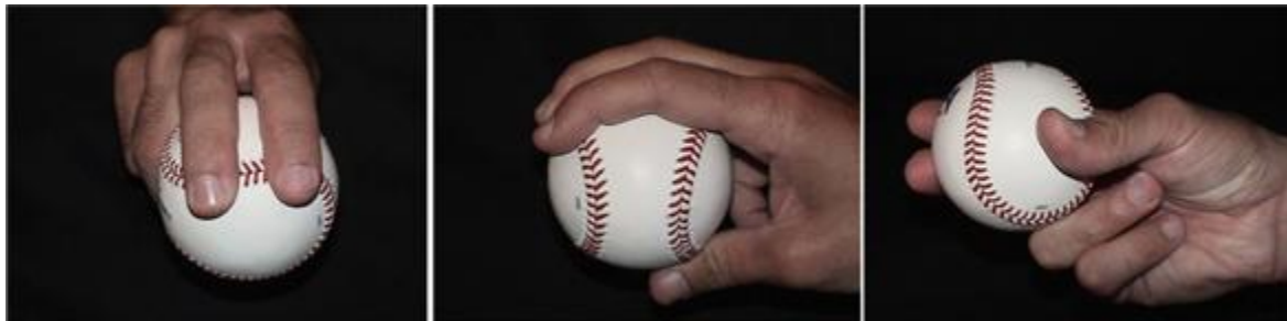
Proper 4 seam grip