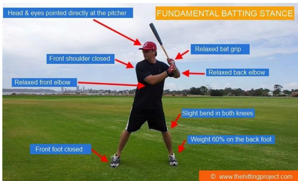
Proper hitting stance