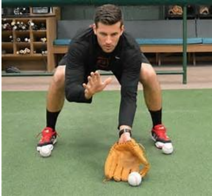
Proper ground ball fielding stance